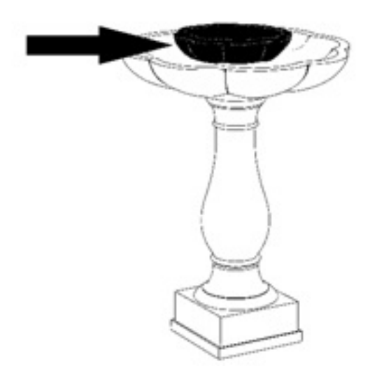
FT-170A (15 lbs) 13"W x 3"H